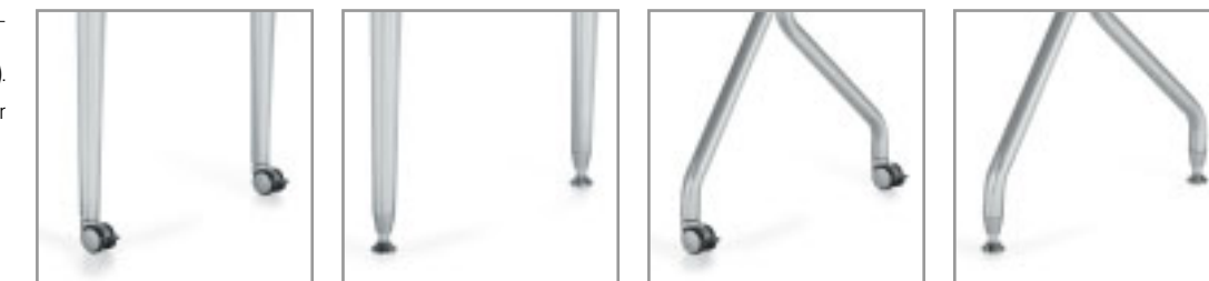
Tapered with Casters

Legs are available in two styles – Tapered and Spider and in two finishes in Silver (SI) or Black (BK). Choose from adjustable glides or locking casters.