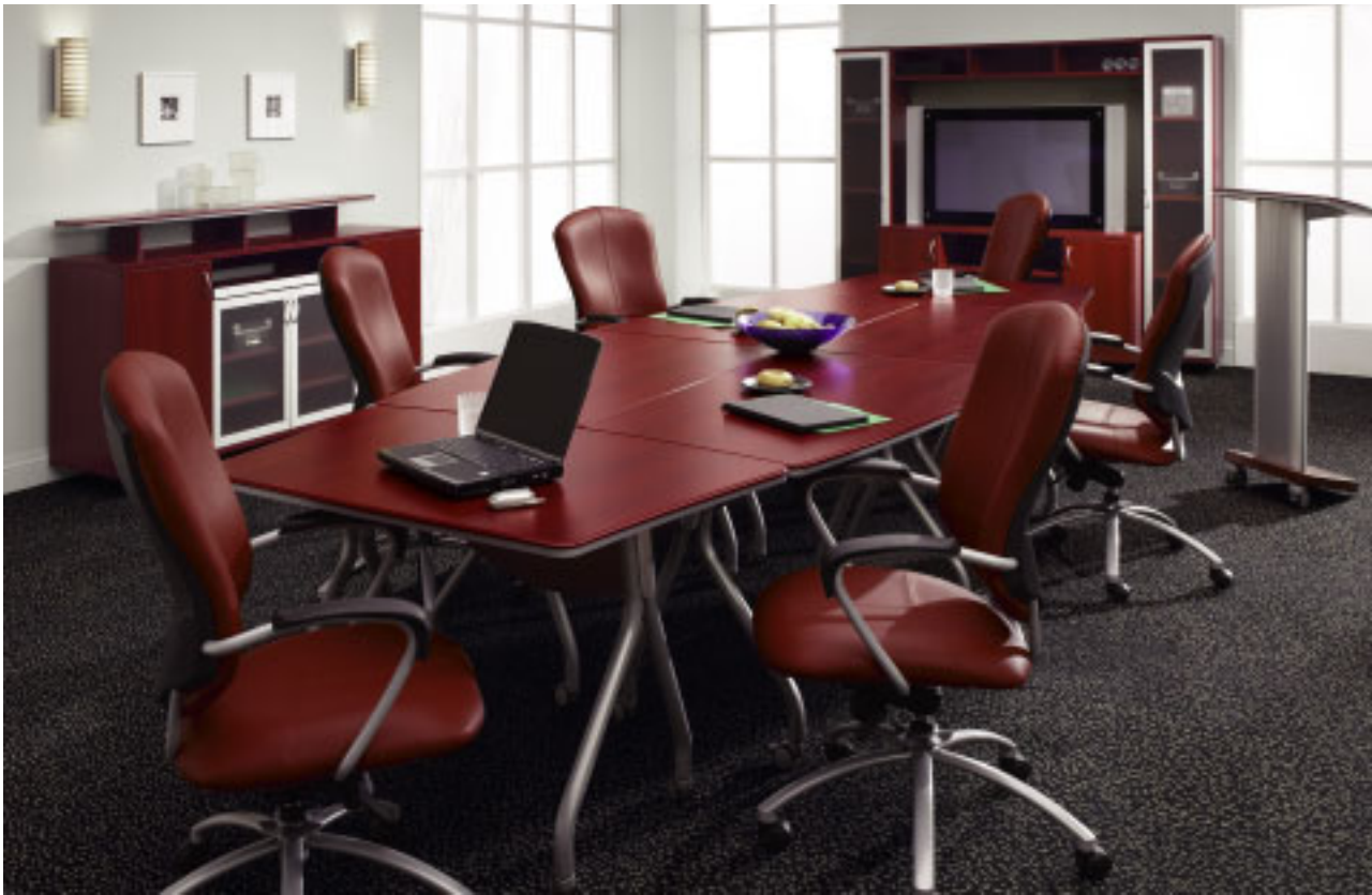
Tables shown in Avant Cherry (AWC) with Silver Spider legs (SI) and trim. Credenza Buffet shown in Avant Cherry.

Sophisticated design maximizes space and efficiency.