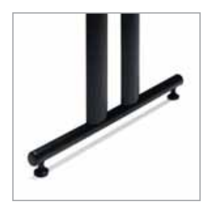
Optional Flip Top "T" Leg facilitates easy storage. Available in black only for many 24" and 30" tops.

36" Double "T" leg for use with new 36" top shapes. Features double black PVC elliptical column covers.