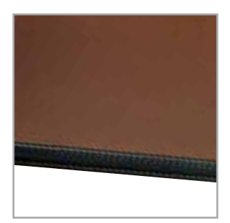
PVC edge Protects both the table edge and the surrounding environment.

ConnecTABLES tops are available in a variety of colors.